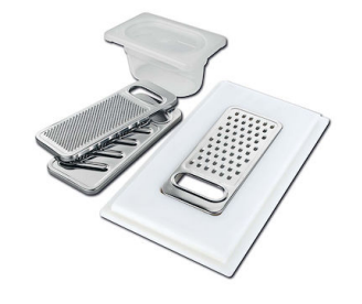
Graters kit with ring-holder and food collection tray 8159 101 * only in combination with the accessory 8644 101