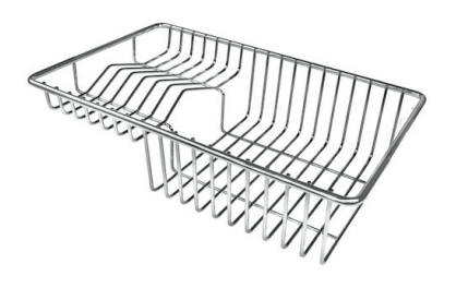
Stainless steel plate rack 8100 303 * only in combination with the accessory 8644 101