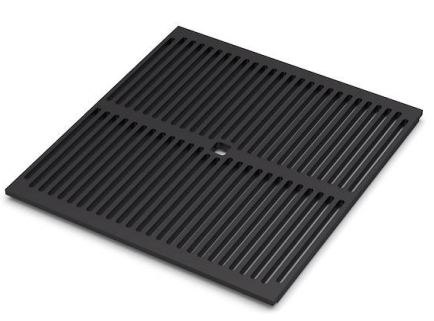
Black grid 8100 617